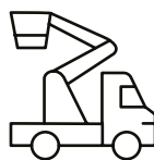
Elevated Work Platform licence