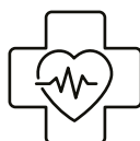
First Aid / Low Voltage Rescue & CPR Training Accredited