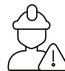
High Risk Construction Work